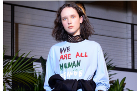
© At Creatures of Comfort Photo by Andrew Toth/ Getty Images