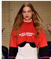
© At Creatures of Comfort Photo by Andrew Toth/ Getty Images