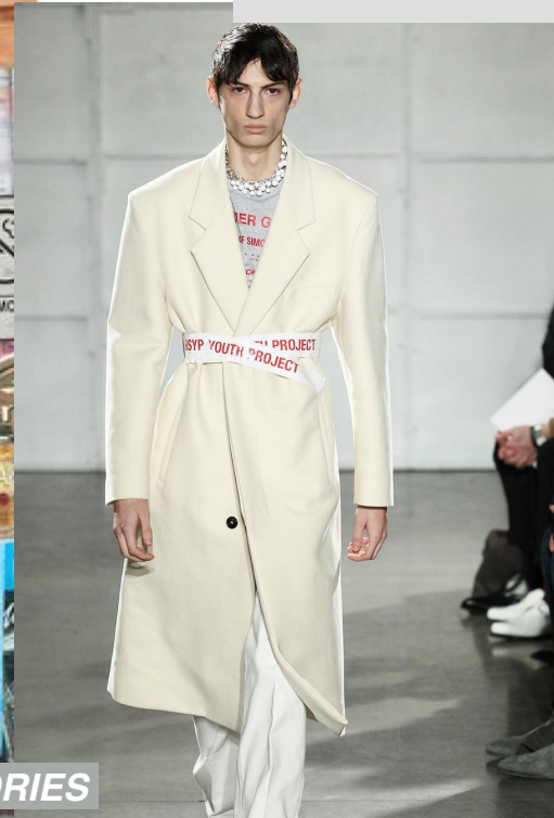
PROTEST SIGN WRITING