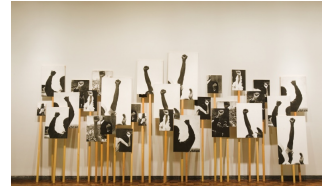
© Annette Lemieux Left Right Left Right