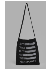
© Raf Simons Jute_by HYPEBEAST ANTONIOLI