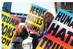
© Paul Chan and Badlands Unlimited, New Proverbs (2017).