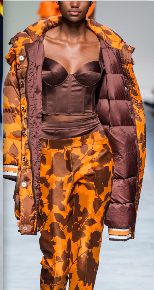
Ermanno Scervino SS19