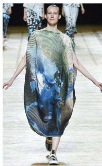
© Issey Miyake Spring 18 RTW