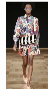
© Whyred Stockholm Spring 18 RTW