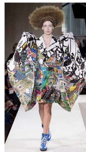
© Comme des Garçons Spring 18 RTW