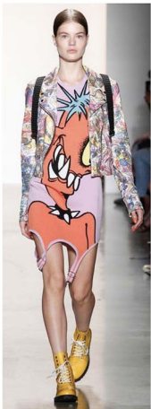
© Jeremy Scott Spring 18 RTW