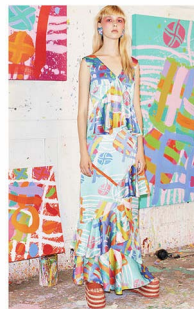
© House of Holland Resort 18