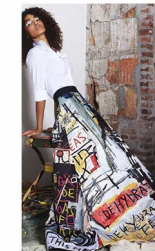
© Alice + Olivia Resort 17