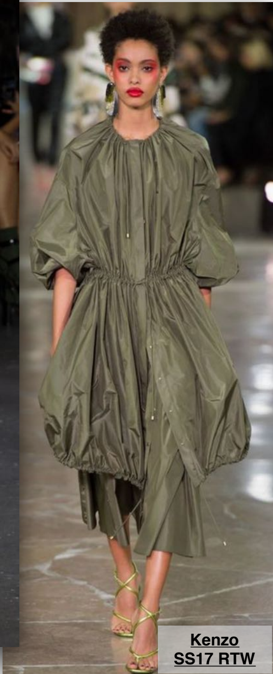
Kenzo SS17 RTW