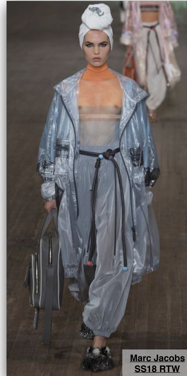
Marc Jacobs SS18 RTW

With the trend for transparency a key theme, it makes sense that the lightweight parka is to become a key item for SS19. Good for transitional deliveries or a key festival must have. The lightweight parka for SS19 has volumous detailing, or reminiscent of a fisherman's jackets.