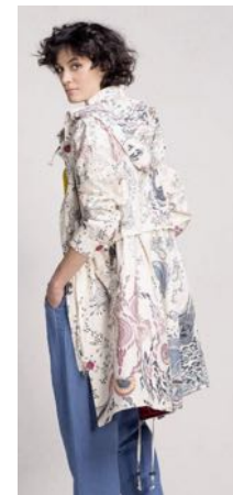
© lightweight parka the ivko waterproof parka source ivko.com