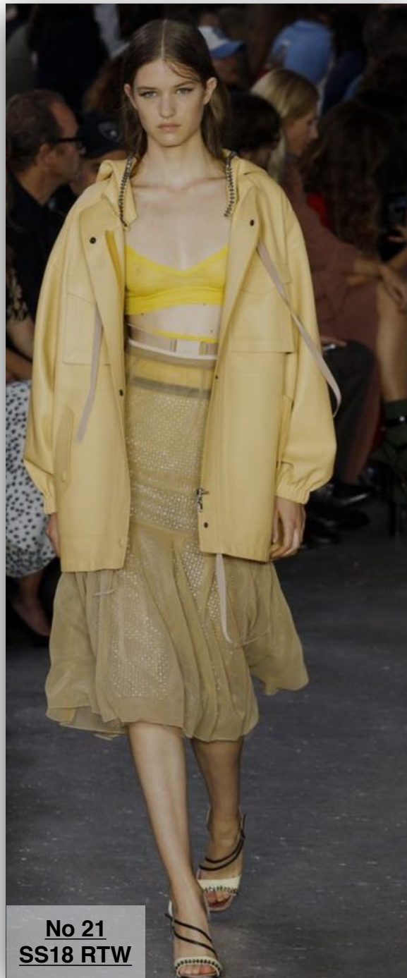
No 21 SS18 RTW