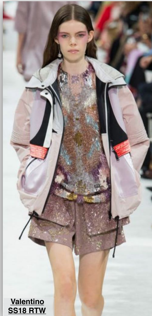
Valentino SS18 RTW