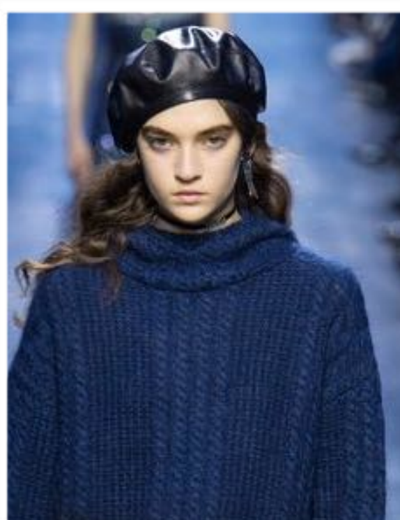
Christian Dior Fall 17 RTW