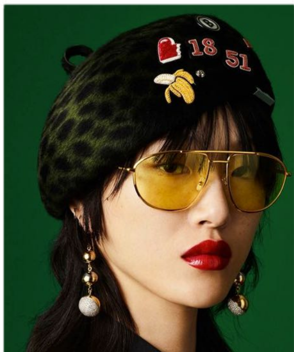
Selfridges A Gender line

The beret for transitional deliveries with deep ribs is a throw on accessory and a must have in collections.