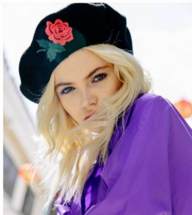
Selfridges A Gender line