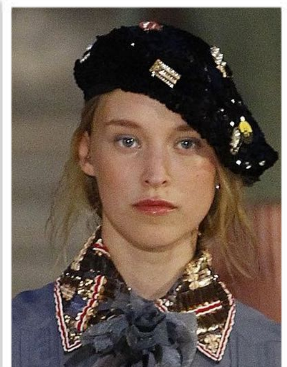
Apartments 03 São Paulo SS17