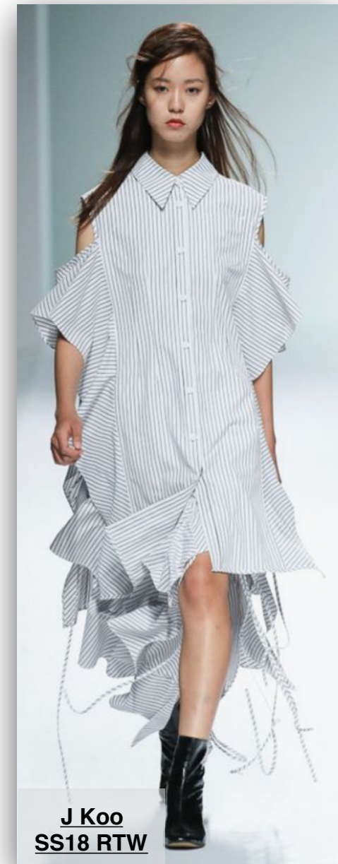
J Koo SS18 RTW

The shirt is fast becoming an essential wardrobe item. This SS19 we see the longer line shirt with added detailing in asymmetrical cuts, offset button placements and exposed necklines instead of the traditional collars. The pyjamas styling is still key with longer sleeve proportions giving the relaxed look. Ties and gathered details are still key to turn the plain white shirt into a key statement piece for SS19.