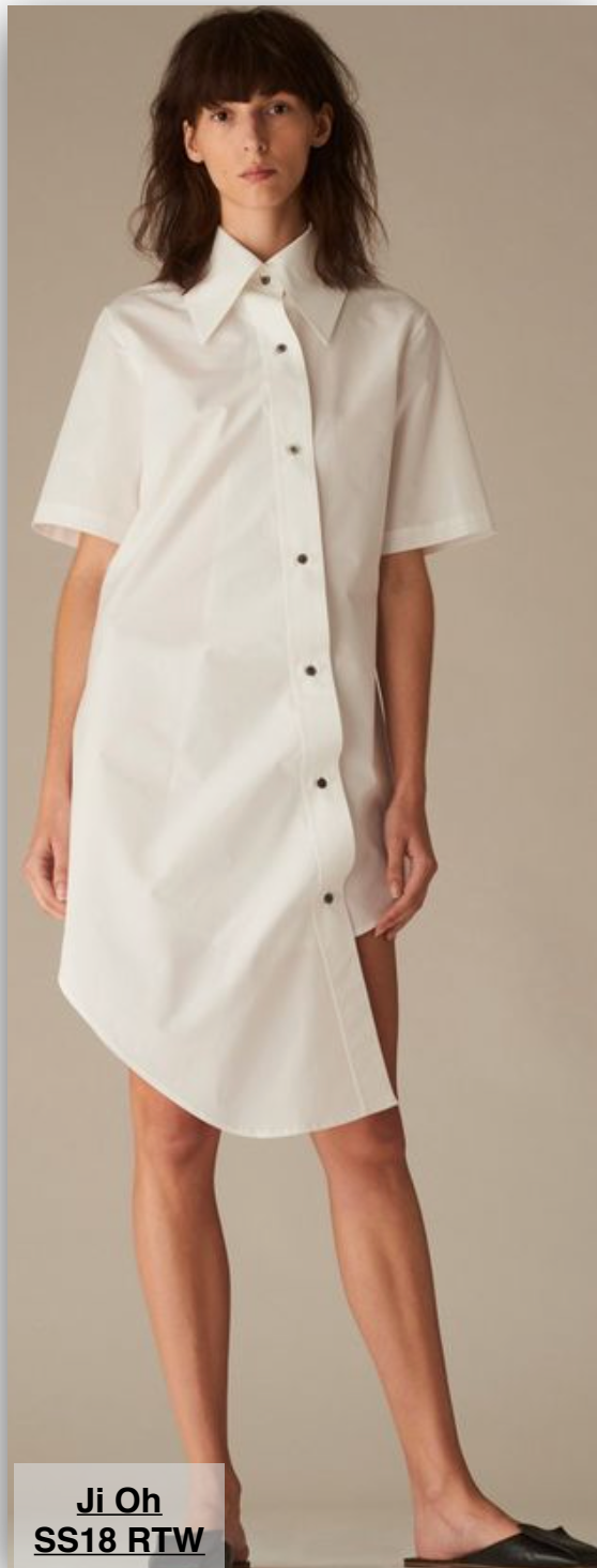
Ji Oh SS18 RTW